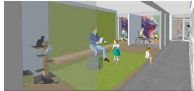
FREE-ROAMING CAT ROOM