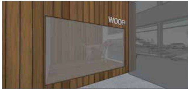
FEATURED PET DORM