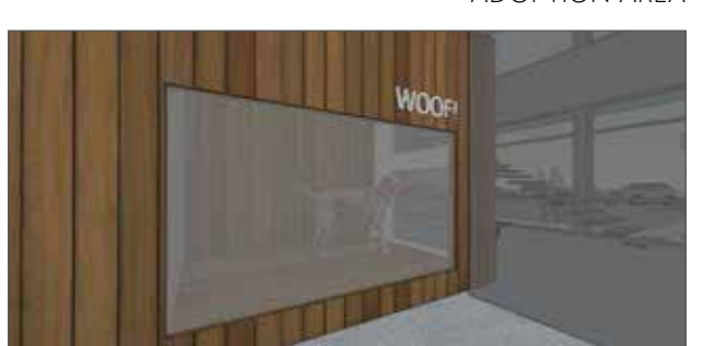
FEATURED PET DORM