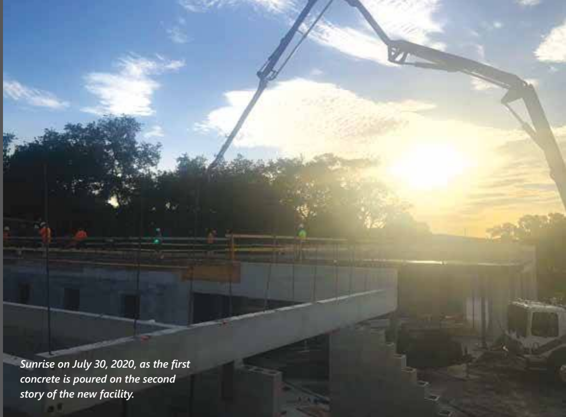
Sunrise on July 30, 2020, as the first concrete is poured on the second story of the new facility.