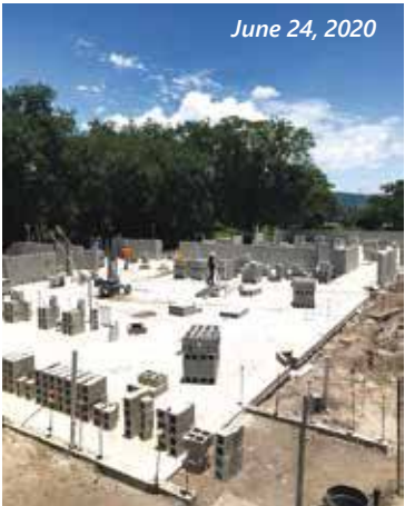
June 24, 2020