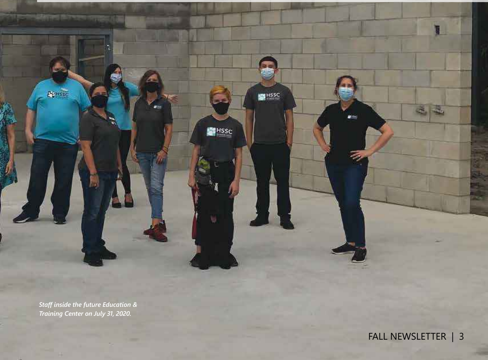
Staff inside the future Education & Training Center on July 31, 2020.

It has not been the year anyone expected, but we are making the most of it. As always, none of it would be possible without you. Thank you for being a constant when everything else has been in flux. We appreciate you more than ever, and we cannot wait until we can throw open the doors of our new space and welcome everyone inside.