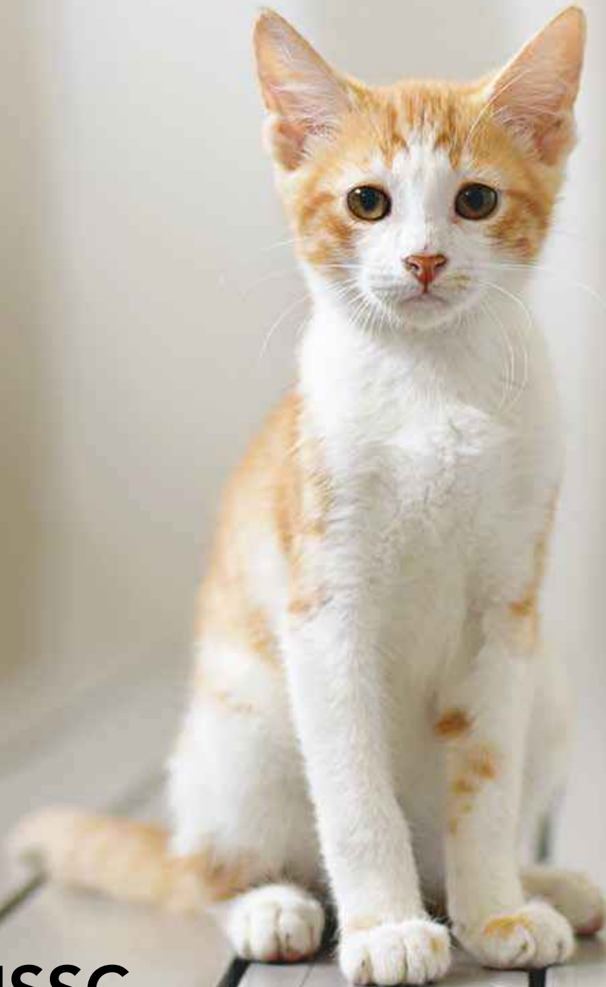
Clementine, HSSC Alum