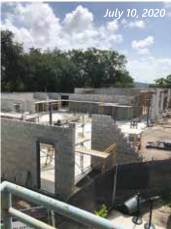
July 10, 2020