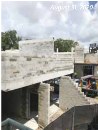
August 31, 2020