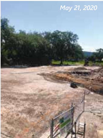
May 21, 2020

FOUR MONTHS AGO, THE EASTERN HALF OF OUR CAMPUS WAS A FIELD OF DREAMS. Now, those dreams have become concrete and steel. The future of the Humane Society of Sarasota County rises while the staff, volunteers, and visitors carry on in the present. If all stays on track, we can expect to occupy the new space in January, with the entire project completed by June 2021. Keep up with construction progress and help us meet our fundraising goal at www.hssc.org/give/capital-campaign .