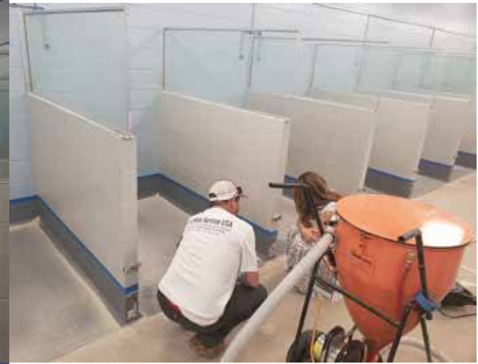
Pod 2 gets a facelift with new flooring, acoustical upgrades, improved drainage, and fresh paint.