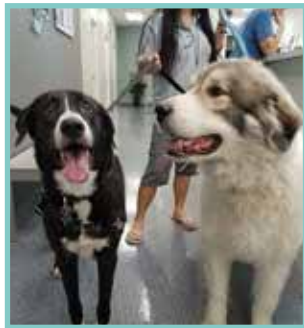
Benny (pictured left) visited us for treatment for an ear infection, and of course, his big brother Teddy (pictured right) accompanied him for moral support.

To reduce animal homelessness and overpopulation in our community, we believe in paying it forward to other organizations. When animals at Sarasota County Sheriff's Office Animal Services require advanced medical care, our clinic treats these animals at no cost thanks to our community partnerships. We hope to continue to expand our partnerships and our overall impact in 2018.