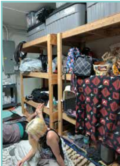
HURRICANE IRMA: STAFF QUARTERS DURING THE STORM

We would not be able to care for over 1,600 animals each year were it not for the generosity of individuals, corporations, and foundations. We are especially grateful to our Foundation Partner, the Community Foundation of Sarasota County. Their $25,000 grant made our "Clear the Shelter" campaign possible and provided medical care for animals affected by the hurricanes.