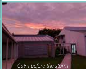
Calm before the storm