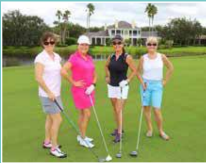
The lovely ladies of Eldridge Body Shop —the 2017 Title Sponsor for the 13th Annual Humane Society Golf Tournament.

Whether we're taking our Mobile Adoption Center "Big MAC" for a spin around St. Armands Circle or manning our table at the Phillippi Farmhouse Market, there's a good chance you'll see HSSC adoptable pets and volunteers out in the community. In 2017, we attended over 60 community events , and that's not counting the 5 special events we hosted ourselves. There's nothing we love more than a party for a good cause. We hope to see you out and about in 2018.